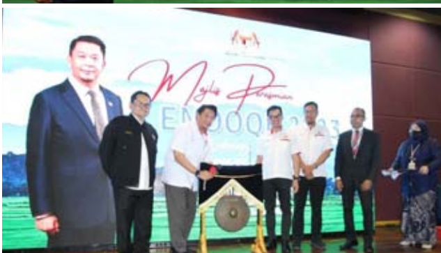
Deputy Health Minister, YB Dato' Lukanisman bin Awang Sauni, officiating the Opening Ceremony by hitting the gong three times.