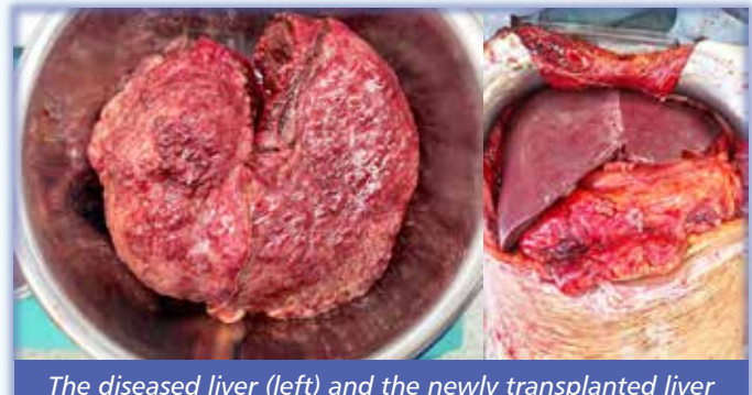
The diseased liver (left) and the newly transplanted liver (right)

Liver transplant comes with challenges. To start, many of which who pledge to be a liver donor does not materialise, which leads to scarcity of cadaveric liver. This could be due to high donor family objections and unsuitable liver conditions available for donation - such as fatty liver. To assist some of these issues, Unit Perolehan Organ Hospital (UPOH) team was established in 2019 in 16 hospitals in Malaysia to help identify potential donors. On top of that, in trying to overcome shortage of organs, we have advocated adult living related liver transplant in 2020 and a split liver in 2021.