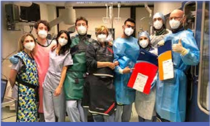
With colleagues at work

Aside from work, I have had some weekends free to explore the great cities of Italy, such as Rome and Naples, to name a few. This center is not without its challenges; however, the team's outlook and approach in the face of adversity have taught me how having the